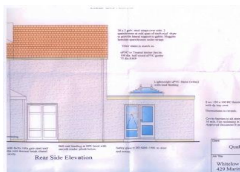
Figure 2 Side view - existing lounge on left

We will make a more detailed announcement nearer to the time when the Garden Lounge is going to become unavailable.