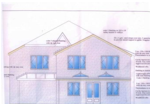
Figure 1 View from the bottom of the garden

We have restarted work on the new extension. When complete it will more than double the size of the Garden Floor Lounge and add two new single bedrooms to the Ground Floor. There will also be a new fire escape route at the far end of the Ground Floor.